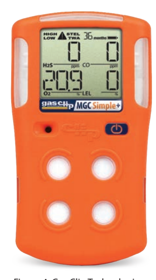
Figure 4: Gas Clip Technologies Multi Gas Clip Simple Plus with photodiode-driven NDIR sensor

With more workers requiring confined space entry than ever before, safety during these industrial operations is critical. Using the latest, most advanced technology to overcome the limitations of older sensor designs ensures the safest conditions for workers, residents in the surrounding areas and the environment. For combustible gas measurement, photodiode-driven infrared sensors are the next generation of safety.